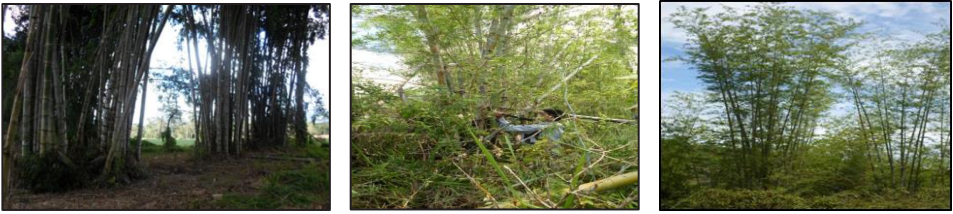
Figure 3. From left to right are plantations of D. asper , B. blumeana , and B. vulgaris in Bukidnon. Note the apparent difference of the three plantations in terms of care and maintenance particularly weeding practices.