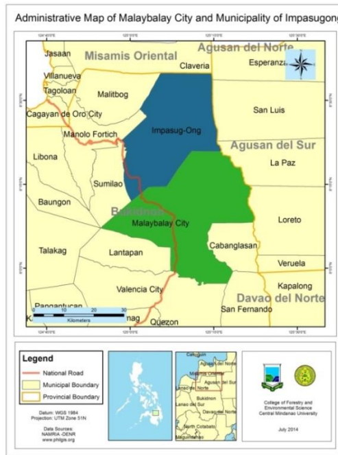
Figure 1. Location map of the study area.

Meanwhile, Malaybalay City falls under Type 4 climate, which is characterized by the absence of a pronounced maximum rainy period and dry season. The months of May to October are usually characterized with heavy rains while November to April is relatively drier period. The average annual temperature and precipitation in Malaybalay is 23.4 °C and 2664 mm, respectively. March is the driest with 115 mm rainfall while September is the wettest with an average of 328 mm rainfall. On the other hand, May is the warmest with an average temperature of 24.4 °C while January is the coolest with an average of 22.5 °C. Compared with the rest of the country, the climate in Malaybalay is relatively cooler the whole year round, and the area is not on the typhoon belt.